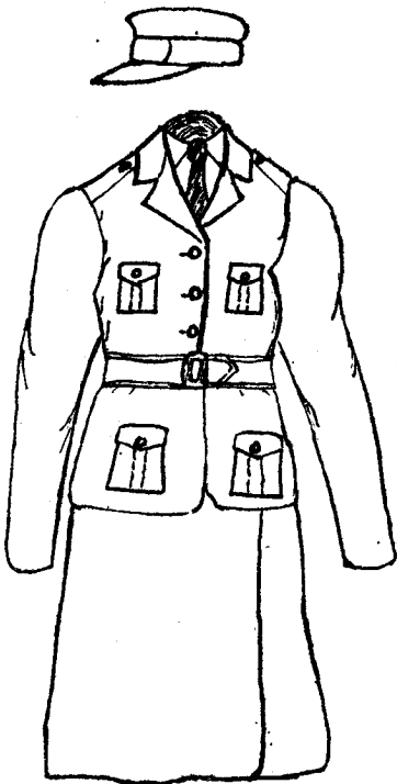
UNIFORM FOR OTHER MEMBERS.

Khaki cotton drill costume uniform with four military pockets in coat; self-coloured belt; uniform to be worn with khaki shirt and tie; skirt pleated side back and side front; the uniform being indicated in the diagram below. Cap: Soft-crowned cap with visor:—